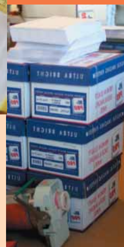
We love the technology that makes quick work