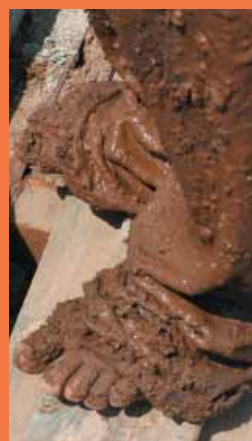
The salt is visible on our land especially after the rain