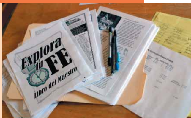
New Curriculum scheduled for completion and distribution in Nov!